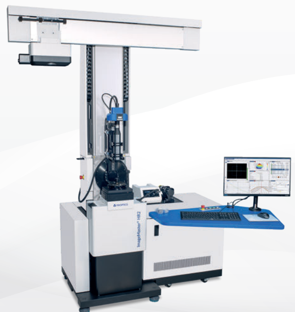
Image quality testing with highest precision and reliability