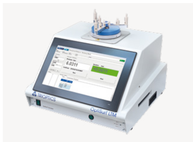
The OptiSurf® LTM non-contact center thickness measurement system from TRIOPTICS

(micrometer) and its tactile measuring principle, which requires direct accessibility of both lens surfaces. As a result, the auxiliary carrier and protective lacquer had to be removed prior to the measurement and then cemented again afterwards in order to continue the processing. This tedious and lengthy work cycle was repeated three to four times for each lens to carefully approach the target specifications. Not only is the process time consuming, but it must also be done very carefully to ensure that the lens is not damaged.