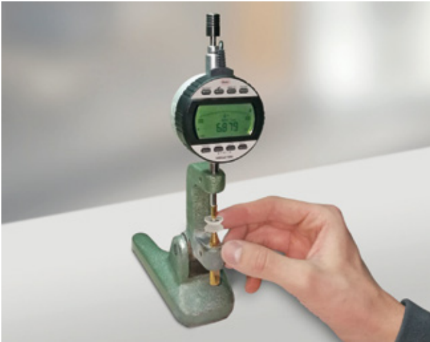
Mechanical dial gauge in use at Pfeiffer Präzisionsoptik