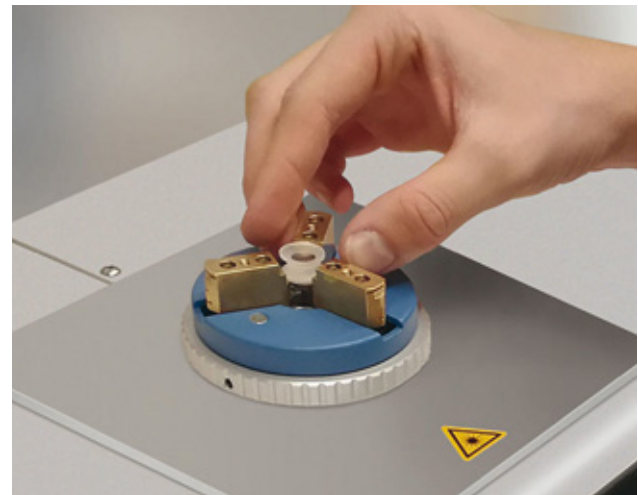
Measuring the center thickness of a microlens using the OptiSurf® LTM

an optimized touch function. “As is standard practice at our company, the measurement results are statistically evaluated and subjected to a pass/fail analysis. Compliance with the tolerances is indicated by a traffic light system, which is very straightforward and user-friendly for the customer.” Pfeiffer views it just the same way. “Our employees were very pleased about the better working conditions for measuring the center thickness of microlenses. At first, they were skeptical about whether the center thickness measurement process would really be that easy. But when they realized that learning how to use the device was simple, it became obvious: the mechanical dial gauge has seen its day.”